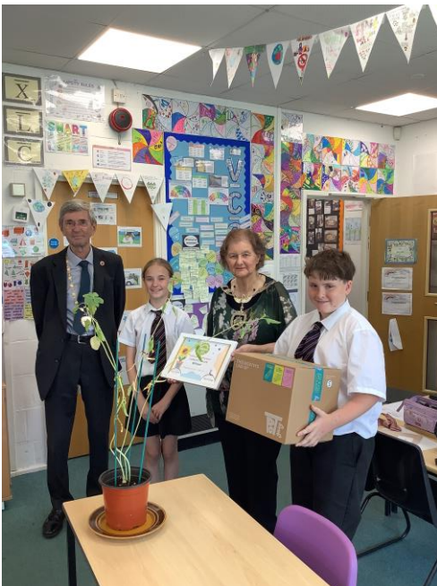
Mayor presenting the certificate and gardening prize to Class 6A. The overall winners of the borough competition. 79cm in height