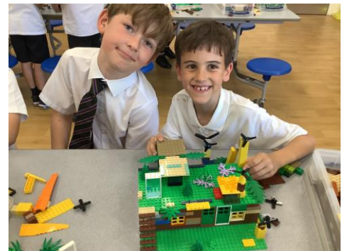
Brickies – Year 3