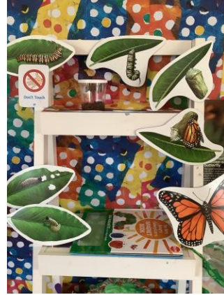
The life cycle of a Caterpillar